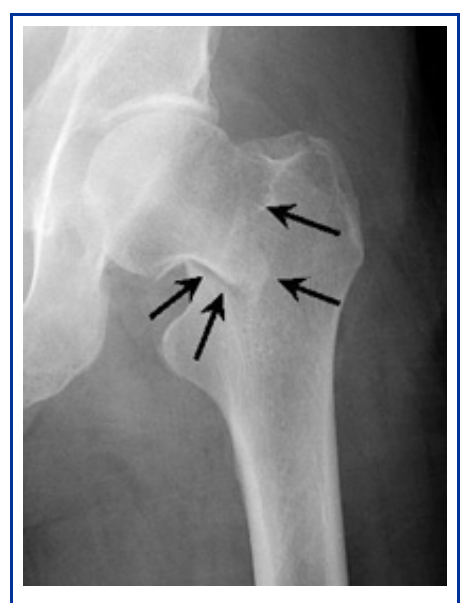
Intracapsular Fracture. This fracture occurs at the level of the "neck" of the bone and may have loss of blood supply to the bone.

These fractures occur at the level of the neck and the head of the femur, and are generally within the capsule. The capsule is the soft-tissue envelope that contains the lubricating and nourishing fluid of the hip joint itself.