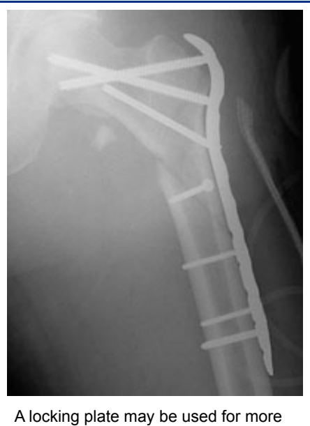
difficult to treat fractures.