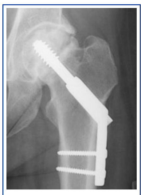
Although the fracture is repaired, the blood supply to the "ball" of the femur is damaged.

In these cases, the blood supply to the ball, or head of the femur, may have been damaged at the time of injury (avascular necrosis). Even though the fracture is realigned and fixed into place, the cartilage and underlying supporting bone may not receive adequate blood. Over a period of time, this may cause the femoral head to flatten out. When this occurs, the joint surface becomes irregular. Ultimately, the hip joint may develop a painful arthritis, despite the surgical repair.