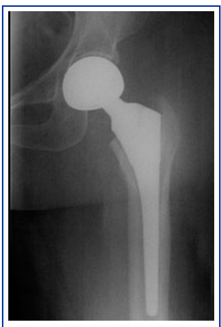
Hemiarthroplasty is a type of hip replacement in which only the "ball" of the hip is replaced.

trochanter. A lag screw is then placed through the nail and up into the neck and head of the hip. As with the compression hip screw, sliding of the lag screw and impaction of the fracture take place.