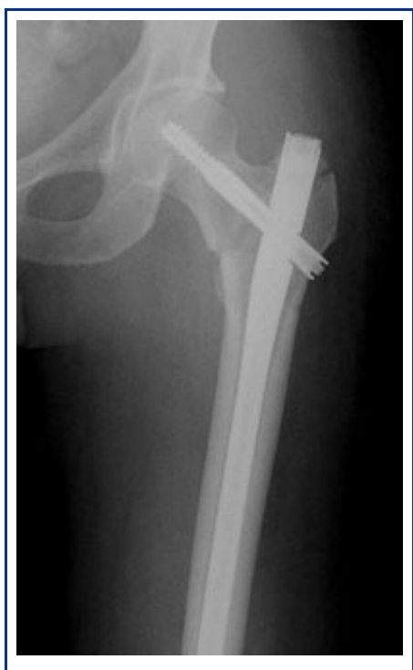
Repair of an intertrochanteric fracture with an intramedullary nail. The nail is in the hollow cavity of the femur (thighbone) rather than on the side of it (as with a plate).

trochanter. A lag screw is then placed through the nail and up into the neck and head of the hip. As with the compression hip screw, sliding of the lag screw and impaction of the fracture take place.