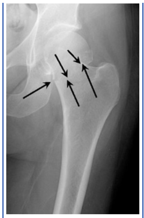
Stable Impacted Fracture. Certain fractures that have not moved ("displaced") may not require surgery. Because there is a risk that they may move later on, they are often fixed.