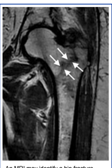
An MRI may identify a hip fracture otherwise missed on plain X-ray.

In some cases, if the patient falls and complains of hip pain, an incomplete fracture may not be seen on a regular X-ray. In that case, magnetic resonance imaging (MRI) may be recommended. The MRI scan will usually show a hidden fracture.