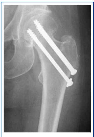
Repair of an intracapsular fracture with individual screws.

If the intracapsular hip fracture is displaced in a younger patient, a surgical attempt will be made to reduce, or realign, the fracture through a larger incision. The fracture will be held together with either individual screws or with the larger compression hip screw.