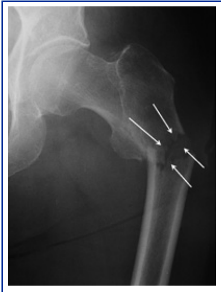
Subtrochanteric Fracture. This occurs even further down the bone and may be broken into several pieces.

This fracture occurs below the lesser trochanter, in a region that is between the lesser trochanter and an area approximately 2 1/2 inches below.