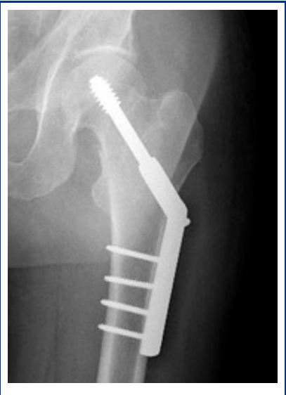
Repair of an intracapsular fracture with a single compression hip screw.