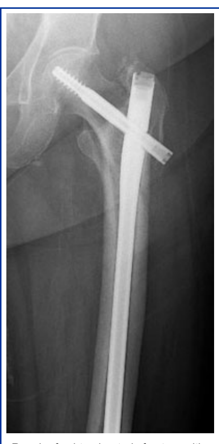
Repair of subtrochanteric fracture with a long intramedullary nail.