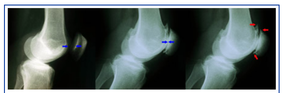
(Left) This x-ray shows a normal knee from the side. The arrows point to the normal amount of space between the bones. (Middle) In this x-ray, the arrows point to narrowed joint space due to patellofemoral arthritis. (Right) Here, the arrows point to

Patellofemoral arthritis occurs when the articular cartilage along the trochlear groove and on the underside of the patella wears down and becomes inflamed. When cartilage wears away, it becomes frayed, and when the wear is severe, the underlying bone may become exposed. Moving the bones along this rough surface is painful.